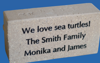
8 x 4" Brick Paver - $250

For more information, contact us at: 561-627-8280, ext. 129 or pavers@marinelife.org