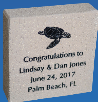
8 x 8" Brick Paver - $450

Brick Paver Timeline: The personalized brick paves are custom-made. Depending on the manufacturer's schedule, it can take approximately 3 to 4 months to be produced. Additional time is needed for the installation process. Pavers will be submitted to the manufacturer for production in February and August, so please plan accordingly.